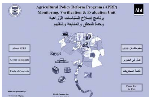
APRP's CD cover page

The CD contains everything in the book, as well as copies of all the MVE Unit's monitoring re-